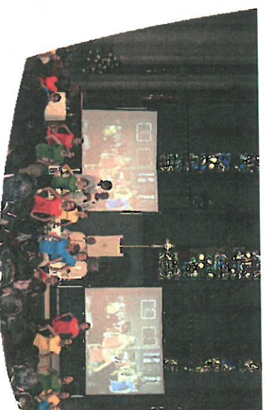
Golden Jubilee Mass